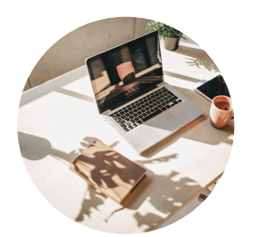
$16.50 Lunch A